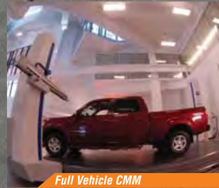
Full Vehicle CMM

Industrial-scale laboratories and testing facilities are accessible to companies and professionals for applied R&D on new technology. Thanks to world-class partners, the Carroll A. Campbell Jr. Graduate Engineering Center houses more than $10 million in state-of-the-art facilities and equipment, including: