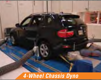
4-Wheel Chassis Dyno