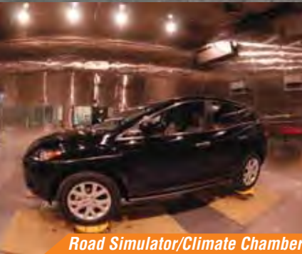
Road Simulator/Climate Chamber

In addition, there are four dedicated laboratories (one for each endowed chair) for studying design and development, systems integration, manufacturing and vehicular electronics. This unique infrastructure of testing facilities and laboratories provides a one-of-a-kind environment focused on solving complex industrial engineering problems.